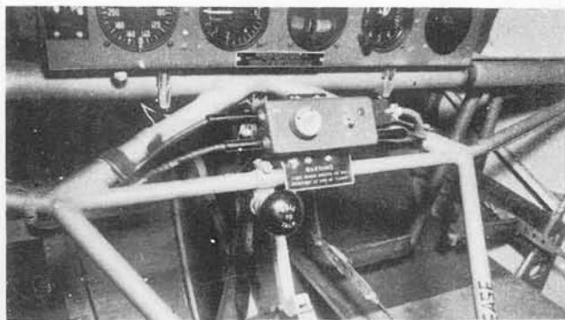
Installation of Control Box and "pull to talk" switch on instrument panel, pilots position in CG-4A glider.

There were no Army Supply Program requirements as of 30 November 1944.