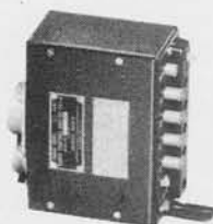
Radio Control Box BC-602-A