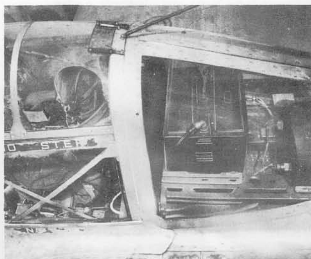
Radio Set SCR-522 installed in P-38E aft of pilot position

Army Supply Program requirements as of 27 December 1944 were 93,555 for the calendar year 1944, and 21,095 for 1945.