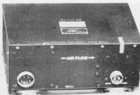
Dynamotor Unit PE-94-C