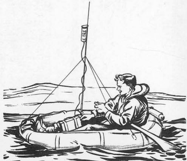
Sea Rescue Beacon Transmitter AN/CPN-16, 16X for use in one-man life rafts.

Test Equipment IE-45 is used for the maintenance of AN/CPN-16 and AN/CPN-16X.